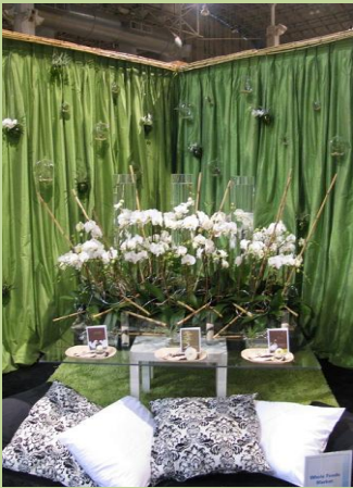
Table Scapes Garden