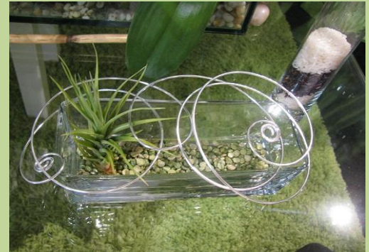
Table description designing with a collection of long lasting blooming and green plants makes a stunning and sustainable statement at your next soirée. We chose a collection of various air-purifying green plants, Tillandsia air plants, and Phalaenopsis orchids . Let your plants work overtime! These beauties double as party favors for your guests. Reduce, reuse, entertain...