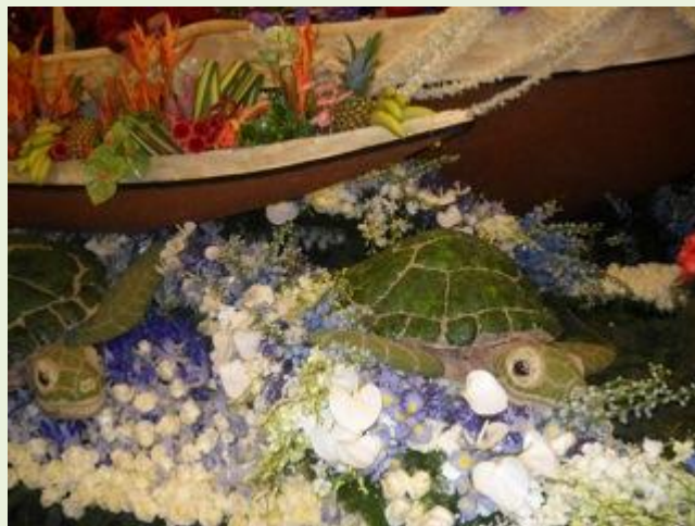
Fiesta Company did 11 floats all in the same warehouse where we were working.