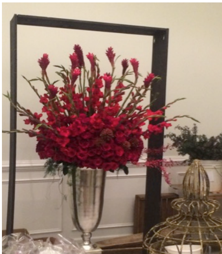
Jody Duncan AIFD's "little red bud vase!"