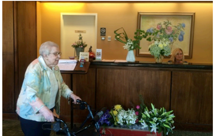
Blooms Over delivered flowers to residents at Mount Royal Towers Nursing Home