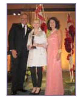
AIFD Award of Merit -Non-Industry Bouquets to Art of San Francisco