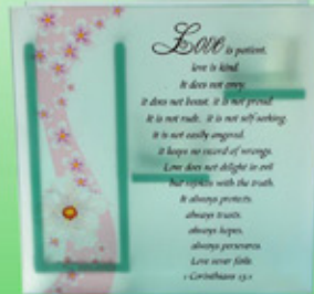
FI6102 Corinthians 13

www creationsbyfitzdesign.com 800-500-2120 service@creationsbyfitzdesign.com