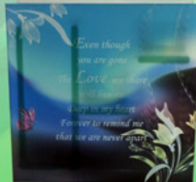
FI6105 Never Apart