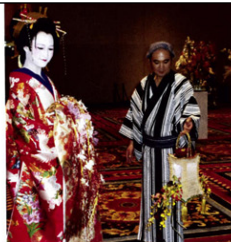
The Kabuki by Yutaka Jimbo, AIFD,CFD.

At the AIFD Symposium you take tons of pictures and come home wanting to be more creative and redesign all the weddings you have planned. I would describe each show as a fashion show with flowers. It's incredible to see the possibilities!