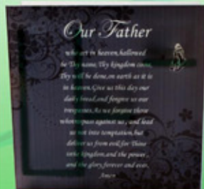
FI6101 Lords Prayer