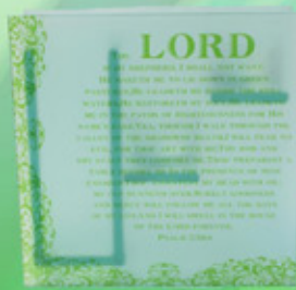
FI6103 23rd Psalm