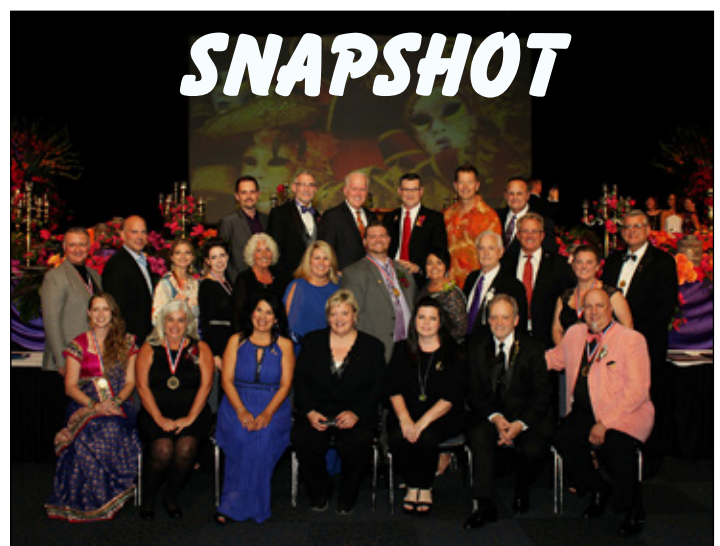
AIFD members that attended the Arkansas State Florist Association Convention that took place at the end of August.

Some financial donations were sent to the Red Cross in Japan and The Green Foundation.