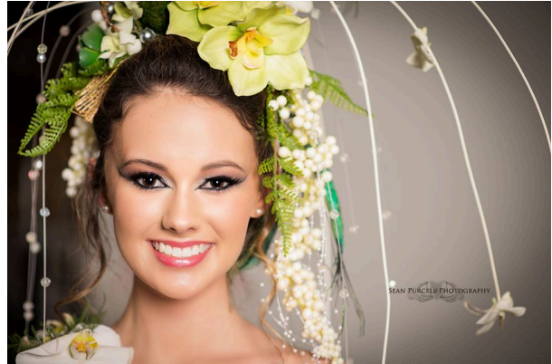
Design inspiration: Waterfalls Geena Sweeney

Please hold the date for next year's Art in Bloom – March 22 – 25, 2018. Accents will keep you posted on the activities planned for this amazing event.