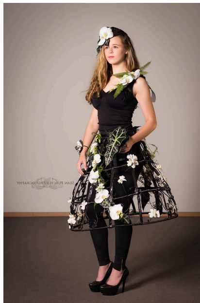
Design inspiration: Orchids by Kate Han AIFD