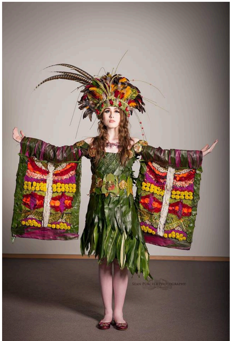
Design inspiration: Tattoos and Traditional Headdresses by Sue Bain AIFD & Robin Weir AIFD