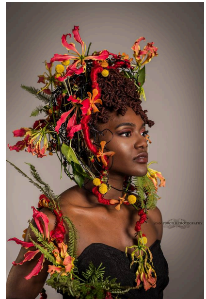
Design inspiration: Volcanoes by Terry Godfrey AIFD & Aisha Crivens AIFD Sponsor: Potomac Floral Wholesale