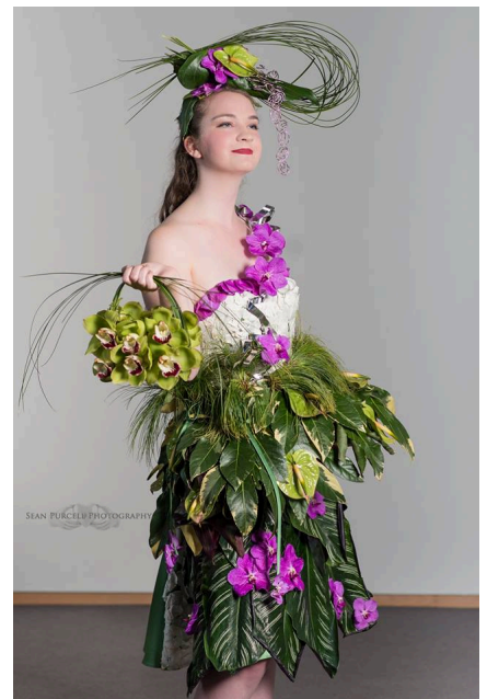
Design inspiration: Island Couture by Chirti Lopez EMC Sponsor: Green Point Nurseries