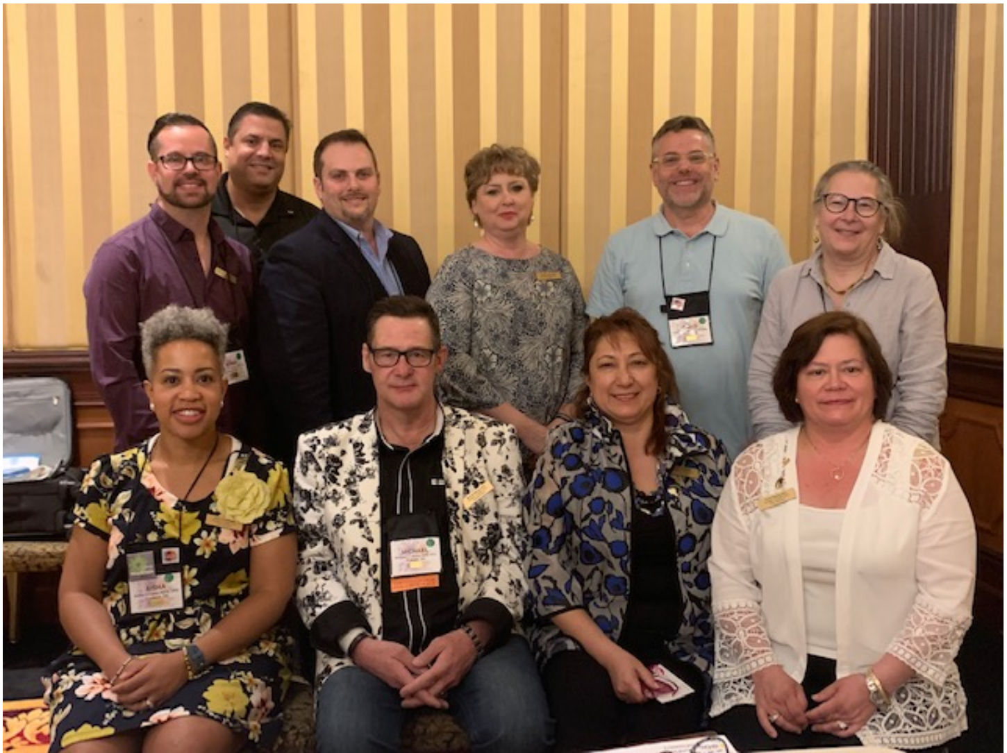
2019-2020 AIFD Southern Board